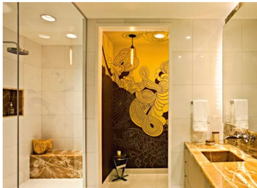
▶ BATHROOM, RIGHT Pharos pendant light from Niche Modern, nichemodern.com Custom wall painting designed by Pattern People (patternpeople.com) and painted by Brent Wick Luis table by Antonio Citterio for B&B Italia, bebitalia.it

tickets on sale now with a special offer for portland spaces readers! www.pawsandsaws.com/pdxspaces