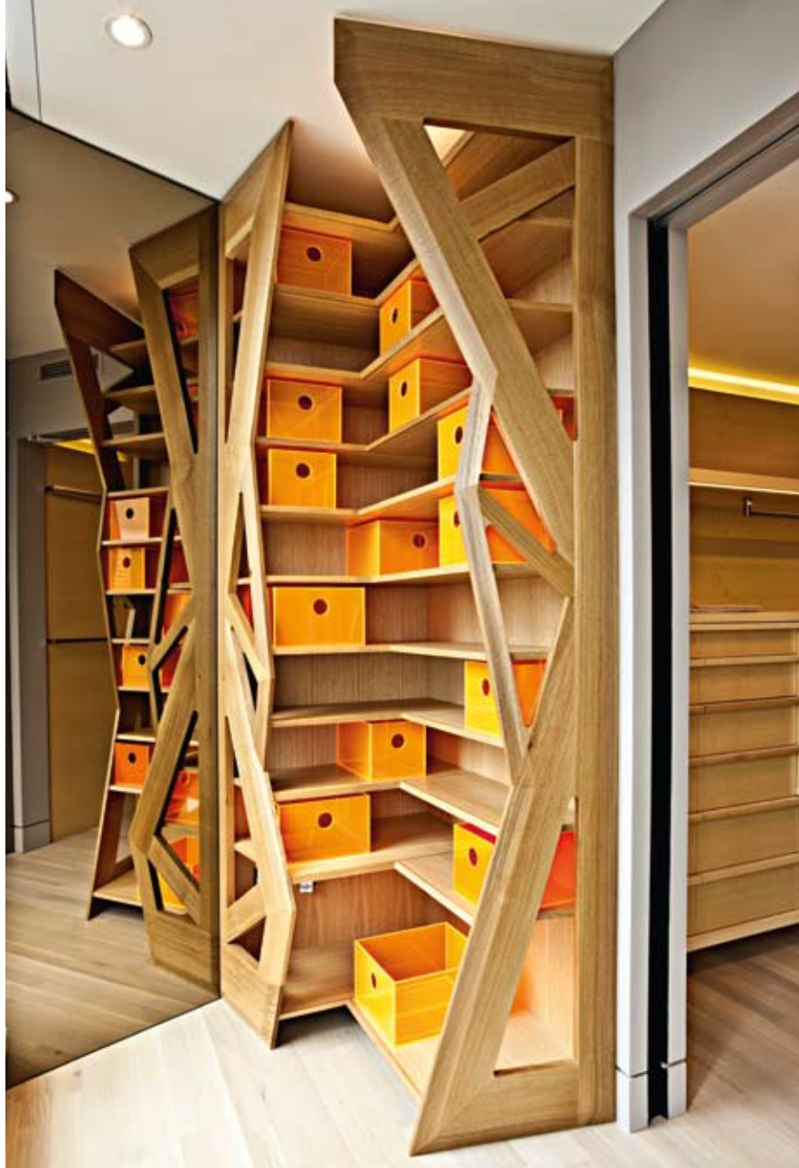
◀ LEFT "Seohs" custom shoe-shelving designed by Andee Hess, fabricated by MADE Inc. Acrylic boxes from Flair Plastics, flair-plastics.com

bathroom, the project grew to become an integrated condo design. The homeowner had found the concept of the 937 building intriguing, with its fractal-inspired exterior and modern details like the sculptural lobby wall (also designed by Hess). Together they incorporated the concepts behind the building into the penthouse. Angled geometry, triangles, and faceted surfaces—the white lacquered cabinet Hess designed for the entry is a showstopper—appear in room after room.